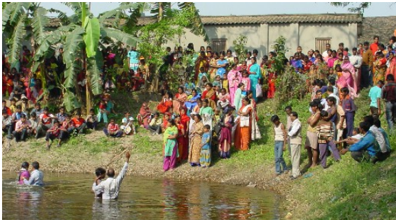
Many have trusted Christ because Christians cared and shared